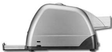
CX-one with hopper